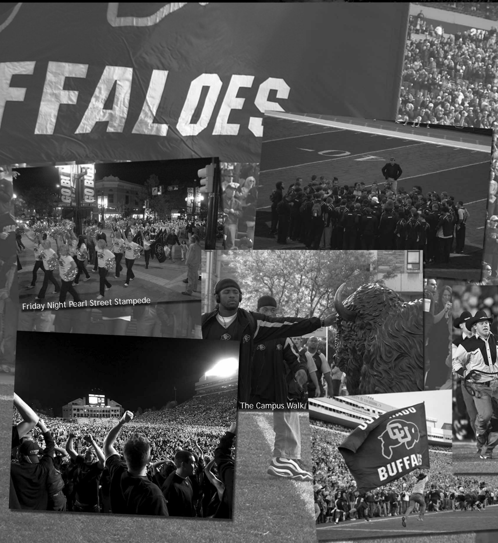
Friday Night Pearl Street Stampede