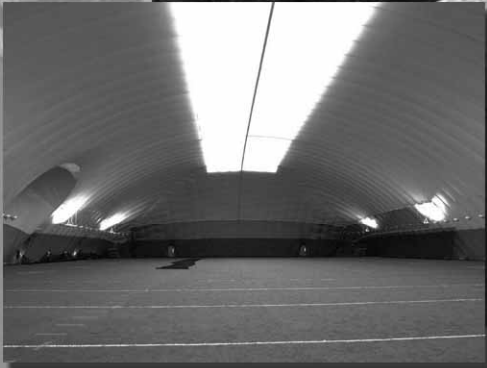
Colorado's indoor practice bubble.